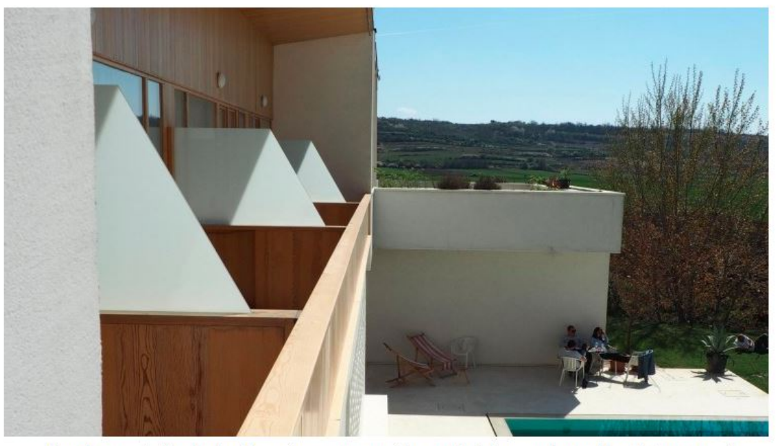
Einen Raum schaffen, in dem Menschen zusammen leben und arbeiten, egal zu welcher Volksgruppe sie gehören – im Hotel Gračanica scheint das zu klappen

German public radio has also aired a new feature about the hotel: <u>Ein Hotel als</u> <u>Ort der Begegnung</u>. For more media reports about us in English, German, French, Italian, Dutch, Greek, Serbian, Albanian and Romanes check our <u>website</u>!